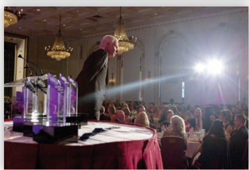
Transforming Supporter $25,000