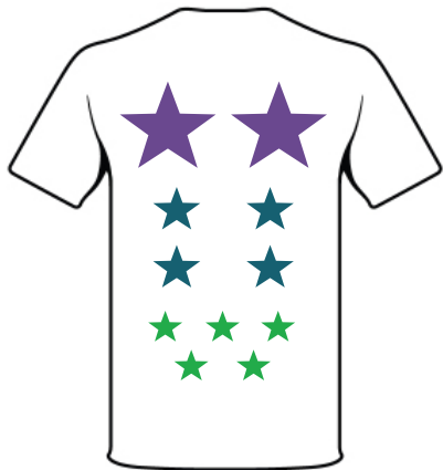
Tiered Logo Placement BACK

P 703.519.5686 F 703.684.1924 pa-foundation.org